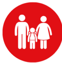
Family & School Support