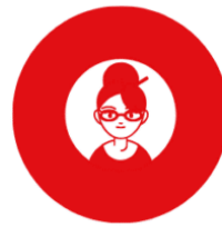
Teacher & Staff Support